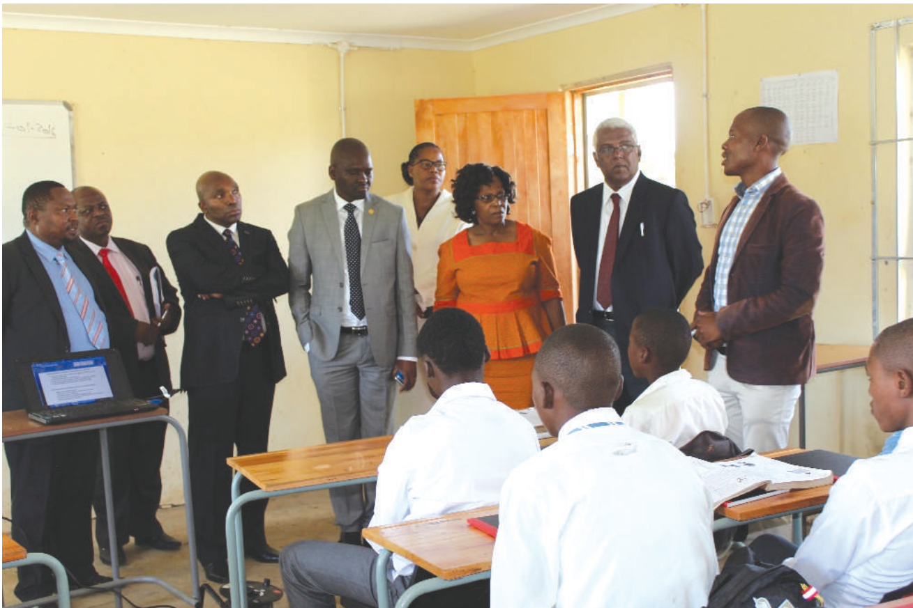
Izithunywa zikwelinye lamagumbi okufundela eSingisi Comprehensive School

Izithunywa zazizimisele impela, njengalokhu zaqala zaya eNhlanhleni Combined School – okuyisikole esikhungethwe