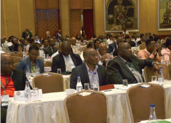
I-Education Indaba ihanjelwe imikhakha eyahlukene kaHulumeni kanye nosomabhezini ukuzobhunga ngesixazululo esingasiza ekwenyuseni izinga lemfumela kulesisiFundazwe saKwaZulu-Natal.