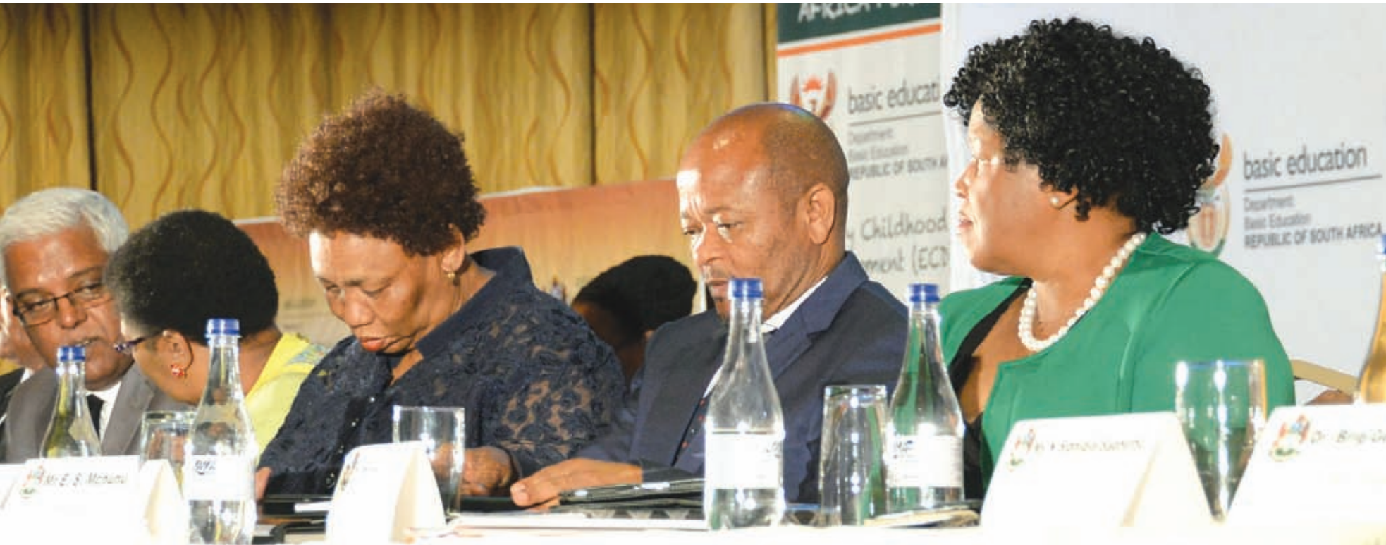
UNdunankulu waKwaZulu-Natal Mnu Senzo Mchunu, uNgqongqoshe wezeMfundo yamabanga aphantsi UNkz Angie Motshekga, kanye noMphathiswa wezeMfundo KwaZulu-Natal UNkz Peggy Nkonyeni.