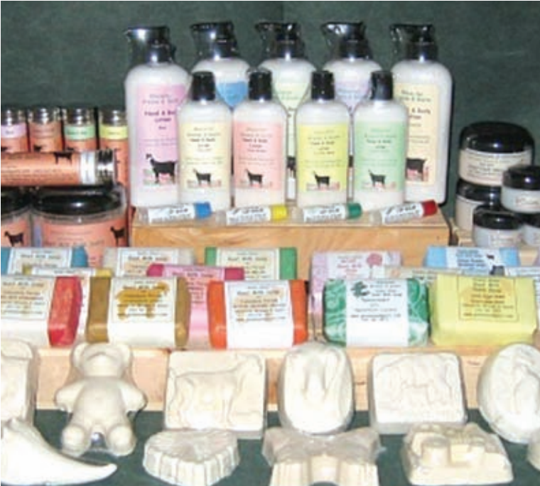
Lena ngeminye yemikhiqizo eyenziwe ngembuzi engavulela izindimbane zabantu amathuba amabhizinisi kuvuleke namathuba emisebenzi

Isisho sesiZulu esithi ‘ukungazi kufana nokungaboni’ sikhuluma ngqo nawo wonke umuntu waKwaZulu-Natali okuthi uma ebona imbuzi acabange agcine ekubalulekeni kwenyongo yayo ngosuku lomsebenzi, akhohlwe ingcebo nomsoco otholakala enyameni nasobisini lwayo mihla yonke. Abangakwazi nabangakuboni abantu kanye nabafuyi bezimbuzi ukuthi amathuba okuphila impilo engumqemane alele emsocweni osezingeni eliphezulu otholakala ngokudla inyama nokuphuza ubisi lwembuzi kanye namathuba amakhulu okuhweba namazwe omhlaba ngesikhumba, inyama kanye nobisi lwalesi silwane. Ucwangingo luveza ukuthi maningi amathuba okuhweba ngobisi lwembuzi njengoba luyisithako esibalulekile emithini eminingi yokugeza, ukugcoba izandla nobuso kanye neyokunakekela isikhumba ethengwayo isetshenziswe mihla yonke kanye naley otholakala ezindaweni zokuphumula ezinjenga mahhotela. Kwezinye izindawo lapho lutholakala khona ubisi lwembuzi isemithini yokugcoba izindebe, emithini yokugeza umzimba, kosawoti bokugeza umzimba, emithini engama shampoo nasenzisheni zokugeza ezahlukene. Ngalo futhi kukhiqizwa oshizi, ice cream, kanye yoghurt.