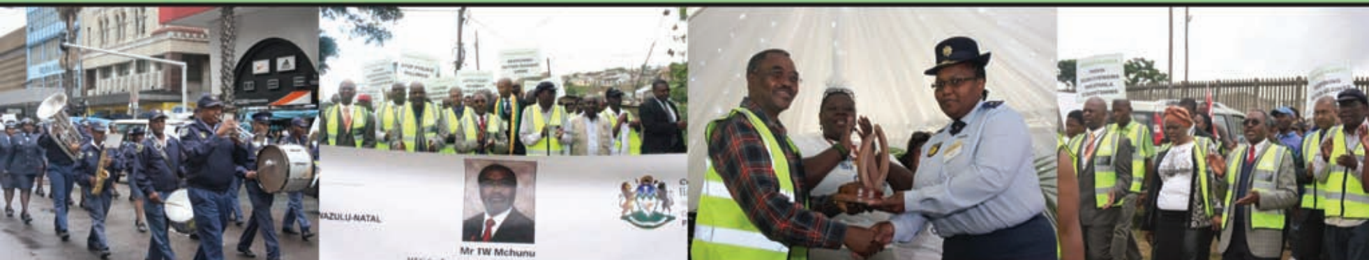
“Masihlangane ngokubambisana silwisane nobugebengu”