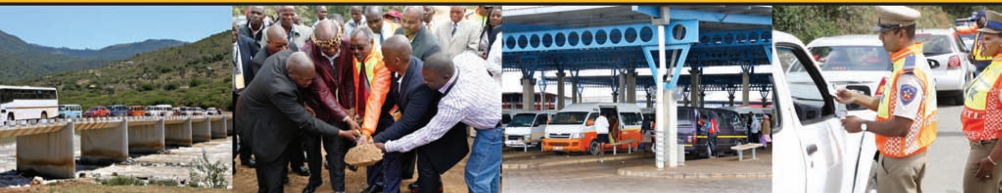
“Ukuphepha Emgwaqeni Kungumsebenzi Wethu Sonke”