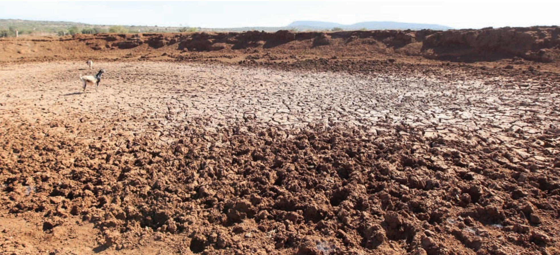
Uphiko lomNyango lwe Food and Nutrition Security selunxuse izakhamuzi zesiFundazwe ukuba zicophelele ngendlela ezisebenzisa ngayo amanzi ziphinde zisebenzise amaqhinga okulondoloza impilo yemikhiqizo yokudla kulesi sikhathi sesomiso esihlasele KwaZulu-Natali.