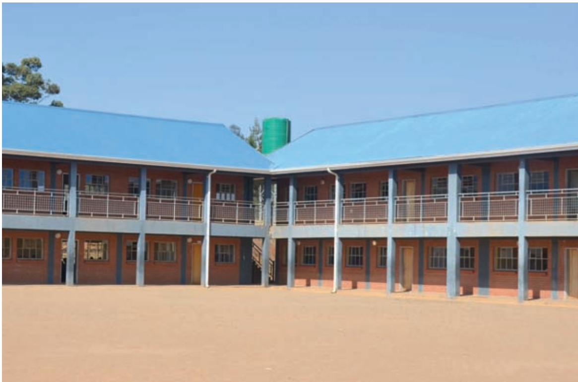
Yiso isithabathaba sesikole esakhiwe uMnyango wezeMfundo KwaZulu-Natal