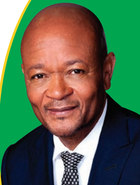
MR EDWARD SENZO MCHUNU KWAZULU-NATAL PREMIER

KWAZULU-NATAL IS GROWING, DEVELOPING AND CARING!