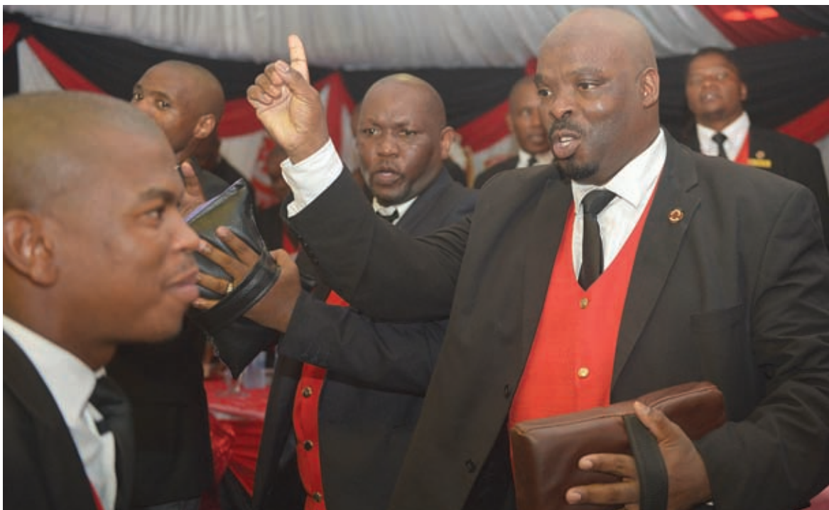
Amadodana aseWesile eShowe ngesikhathi kunenkonziso.

“Lamadodana aseWeseli angabanye alabobantu abenza lokho nesibabongako kakhulu” kusho UNdunankulu. Uthe phakathi kwalababantu besilisa abahlangene lapha Eshowe kunabantu abasebancane okwenza babeyisibonelo esihle kakhulu. Lokhu kukodwa nje kukhomba ukuthi abantu besilisa kufanele bakhule kanjani, bakhulelephi ezintweni ezenziwayo