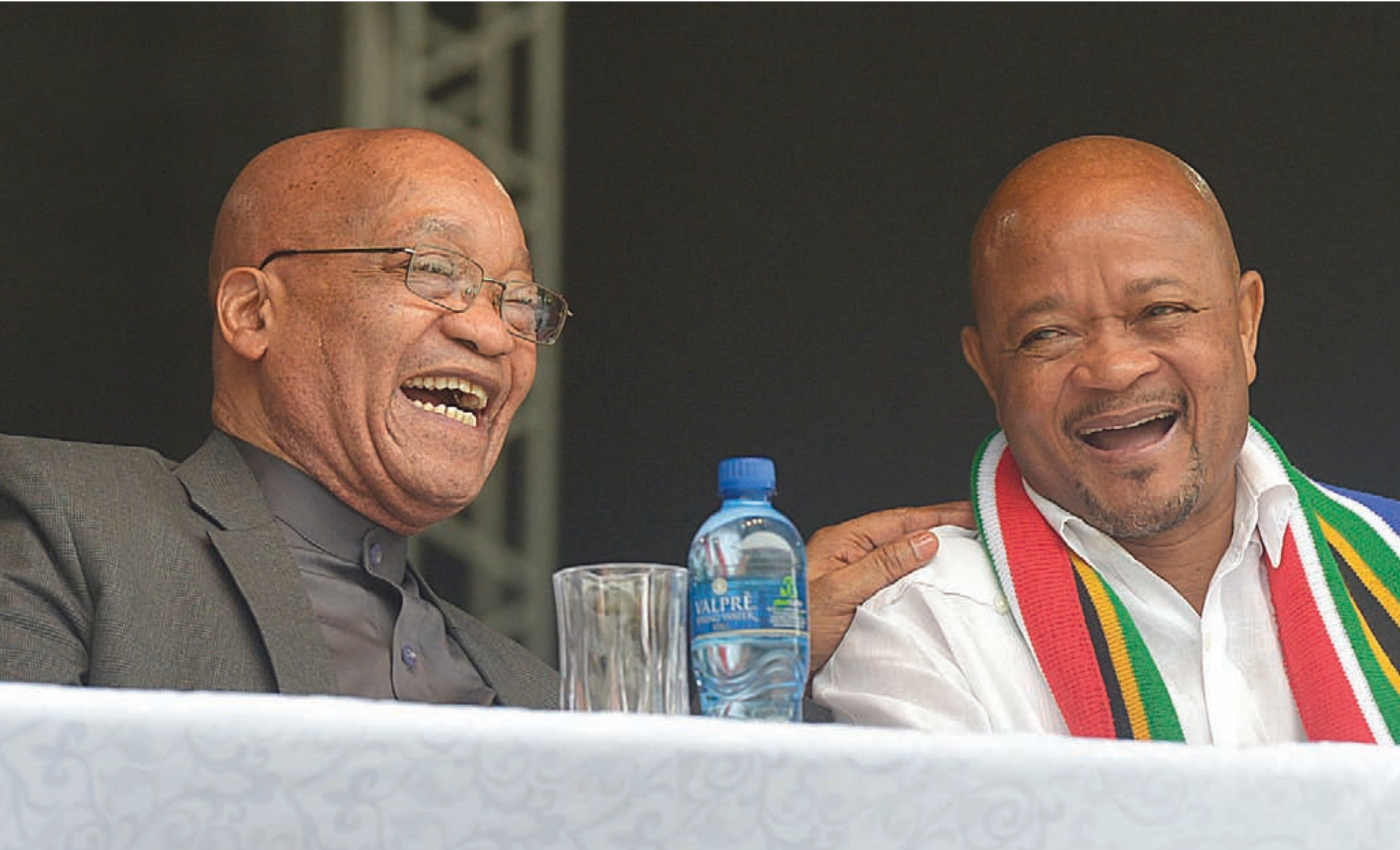
UMongameli wezwe uMnu. uJacob Zuma bencokola noNdunankulu wakwaZulu-Natal uMnu. uSenzo Mchunu ngosuku waMalungelo abantu eMoses Mabhida Stadium.