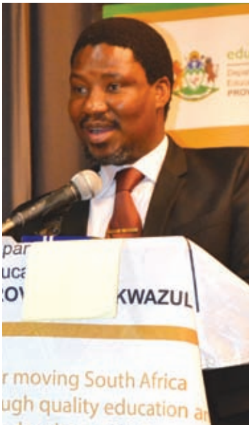
Dkt. Ngogi Mahaye, eHhovisi lika Mphathiswa u Nkonyeni

Okwagqama kakhulu kuloluhambo kwaba izingqinamba ezikoleni okubalwa ukungaziphathi kahle kwabafundi ngenxa yezinga okusetshenziswa ngazo izidakamizwa, izinga eliphezulu lokukhulelwa kwabafundi, izimpi zezigodi ezigcina zikapakele ezikoleni, izakhiwo ezingekho