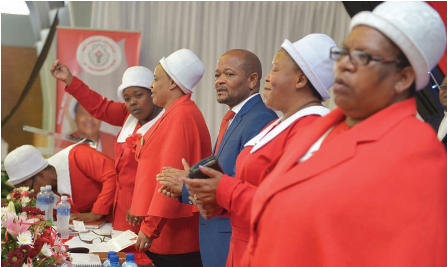
UNDunankulu waKwaZulu-Natal uMnu Senzo Mchunu ngesikhathi ehambela umhlangano woManyano lwamaWesile obuse Gamalakhe lapho obekuthandazelwa khona ukuqiniswa nokuvikelwa kwezinsika zentando yeningi kulelizwe.

UNDunankulu uSenzo Mchunu ucele umhlangano woManyano lwamaWesile obuhlangene eGamalakhe ukuthi uthandazele ukuqiniswa nokuvikelwa kwezinsika zentando yeningi kulelizwe. Ukhulume kanje ngenkathi ethula inkulumbo yakhe yosuku kulomhlangano obuhanjwelwe amasekethe omama bebhantshi baso sonke isifunda sakwaZulu-Natal kuhlenganisa neMatatiele. Uthe uyabonga ukuthi sekungokwesibili ehlanganyela nabenkolo yamaWesile kulonyaka. Okokuqala uhlangane noDodana lwamaWesile Eshowe ngesikhathi sePhasika, naku manje esehlangu noManyano oluhlangana minyaka yonke eGamalakhe. UNDunankulu ekhuluma kulomhlangano utshele amakholwa ukuthi imithandazo yawo ingakwazi ukuvikela isizwe sethu enkingeni yokungazi nezinkinga ezikhungethe izwe lethu okubalwa kuzo ngisho nesomiso. Ubale izinhloko ezintathu athe zibaluleke kakhulu kunoma yiliphi izwe eliqhuba ngentando yeningi futhi eliphokophelele inqubekela phambili. Ubale ukusebenza kwezisebenzi zikaHulumeni (public sector), ukusebenza kwezimbongi ezizimele (private sector) kanye nokusebenza kwezinhlangano zomphakathi okubalwa kuzo ngisho namasonto. Uthe isonto libaluleke kakhulu kuzona zontathu lezizinhloko, kanti ubukhona balo ngeke babukelwa phansi kulesisikhathi ekubonakala ngaso ukuxega kwezimilo. Uqhube wathi iqhaza elibanjwe isonto libalulekile kakhulu kulesisikhathi njengoba iningi labantu libukeka lilahlekelwa yithemba. “Ukubaluleka kwesonto kuyingenxa yokuthi kulona