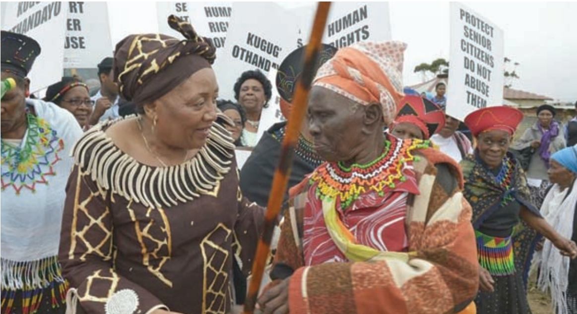
UMnyango wethule inqwaba yezinhlelo zokunakekela izaguga.