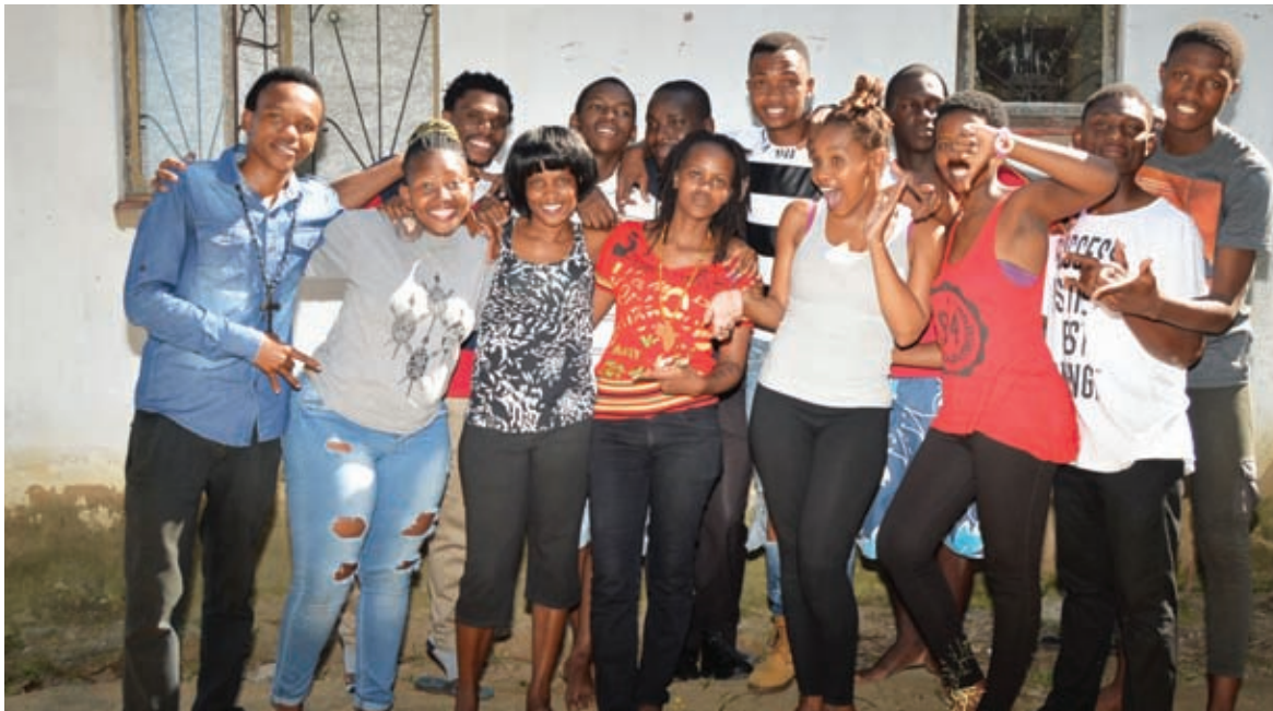
Abalingisi bomdlalo weshashalazi iThe Wedding ozoba sePlayhouse ngoAgasti.