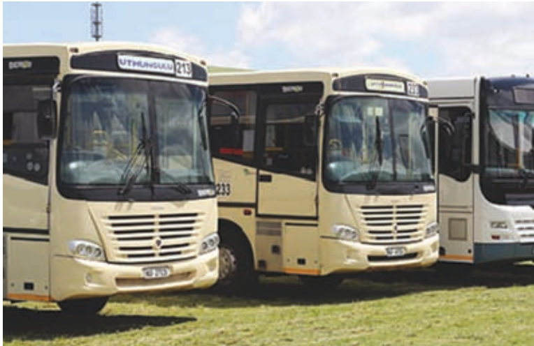
UMSEBENZI wamabhasi ungomunye waleyo uMnyango wezokuThutha oyibhekwe kakhulu ohlelweni lwawo lokuguqula ezomnotho.