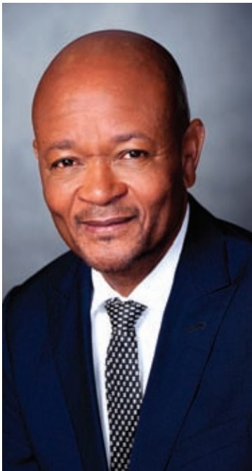
UNdunakulu wakwaZulu-Natal umhlonishwa uSenzo Mchunu

kulesisiFundazwe. Uthe izingane ezingaphezu kwezinkulungwane ezilishuni sezihlomulile ngaloluxhaso oluvela kulemboni kaShukela. Uthe lolusizo luveza ngokusobala ukuthi uma uhulumeni esebenza ngokubambisana nezimboni ezizimele kuningi okungazuzwa UNDunankulu uphinde wabonga iziphathimandla zalemboni ngokuzihlanganisa nalomkhatha wezolimo omkhumbuze impilo yeqhawe lomzabalazo wabantu nenhlangano ye ANC iNkosi u-Albert Luthuli owayenguMengameli we ANC owasebenza kanzima ebamba imihlangano nabalimi ezimobeni zako-Goroutville. Uthe iNkosi ULuthuli ishiye umzekelo oyohlala ukhunjulwa njalo. Uthe uswele imilomo eyizinkulungwane ukubonga kuleziziphathimandla ezitshale ngaphezu kwezigidi