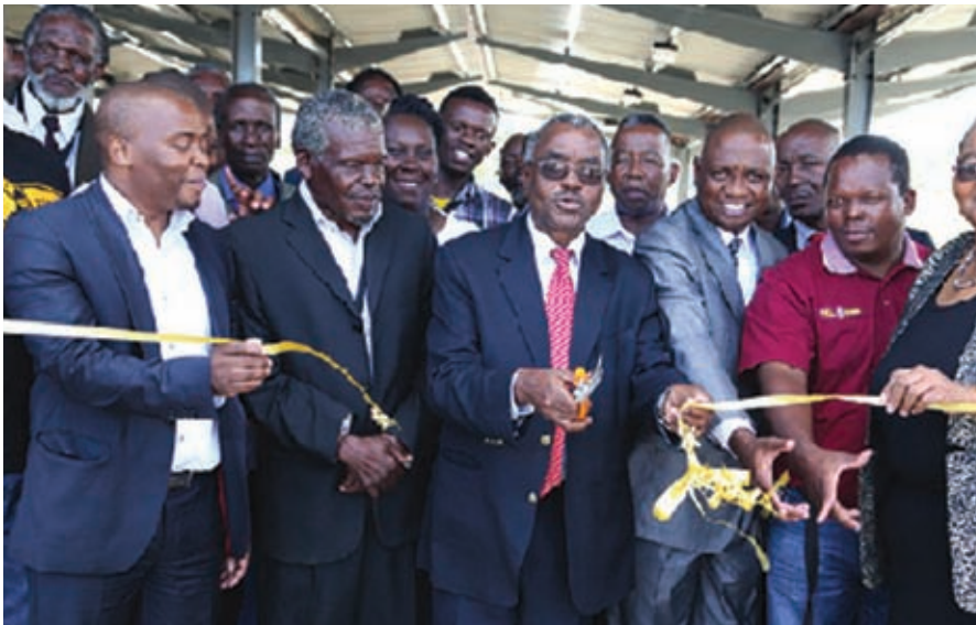
PHAKATHI kwemisebenzi uMnyango wezokuThutha ozishaya isifuba ngayo yileyo yokwakhiwa kwamarenki kanokusho njengoba esithombeni kuvulwa eyaseMondlo eBaqulisini.

UMSEBENZI osuwenziwe uMnyango wezokuThutha KwaZulu-Natal kule minyaka edlule uyakuqeda ukungabaza bese uqinisa ithemba ngekusasa eliqhakazile lesi sifundazwe esibheke kulona.