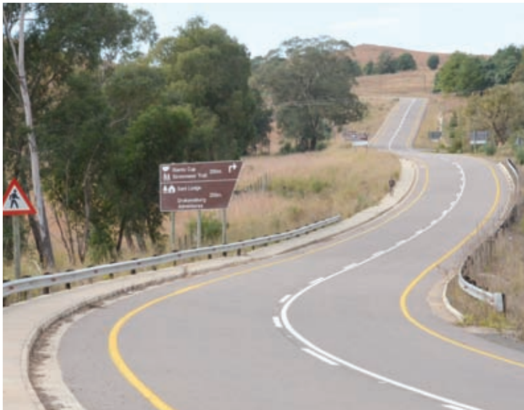
Umgwaqo iSani Pass oxhumanisa iNingizimu Afrika neLesotho.