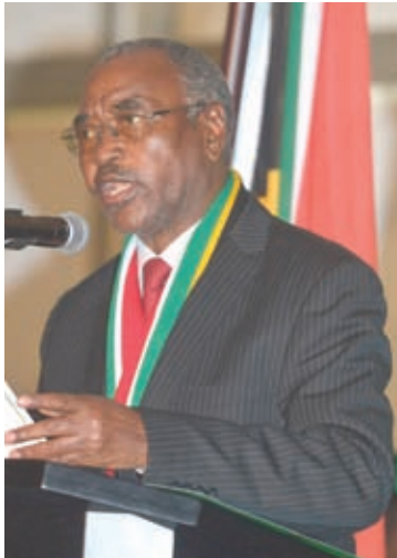
UNDunankulu wesiFundazwe saKwaZulu-Natal uMnu Thembinkosi Willies Mchunu

ukuze sonke sithole inkululeko. Kuthule kwathi cwaka ngenkathi ebalala isigameko lapho uMandela ayalela khona ummeli wakhe ecaleni laseRivonia ukuthi uma betholwa benecala, benikwa isigwebo sentambo angabaceleli ushwele. "Lokhu kwakukhombisa ubuqhawe, ukuzimisela nenkolelo enzima kwiNingizimu Afrika ebumbene nengacwasi" kusho uNdunankulu. Uqhube wathi amagalelo nemizamo kaMandela yaygugquzela umhlaba wonke ngoba wayengumholi owayemele intando yabantu. Umchaze njengomuntu owayehlomphe, engazithwele futhi ebazisa abantu. "Ngenkathi ezovota okokuqala ngo 1994, uMandela wakhetha ukuvota oHlange, eNanda nokwathi emva kwalokho waya ethuneni likaMongameli we-ANC iNkosi Albert Luthuli. Lokhu kwakuwuphawu lokukhombisa inhlonipho nokuzehlisa" kusho okaMacingwane. Uthe umlando nomzabalazo wenkululeko kulelizwe uyahambisana negama likaMandela, wathi yingakho abantu emhlabeni wonke befikelwa ukukhuthazeka uma kukhulunywa ngoMadiba. Uthe ngemisebenzi