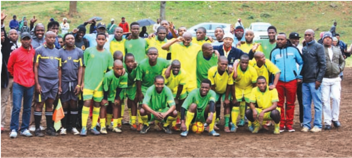
Abadlali bamaqembu ebhola lasehositela iMadala Stezi neKwadukemini bebonisa ubumbano emva komdlalo wamanqamu.